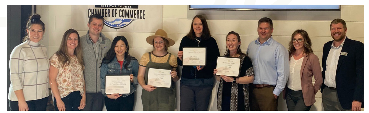
2023 Top Four Enterprise Challenge Winners & Baker Boyer Team

For more information and to see a list of previous winners, visit https://chooseyakimavalley.com/getting-started/enterprise-challenge/.